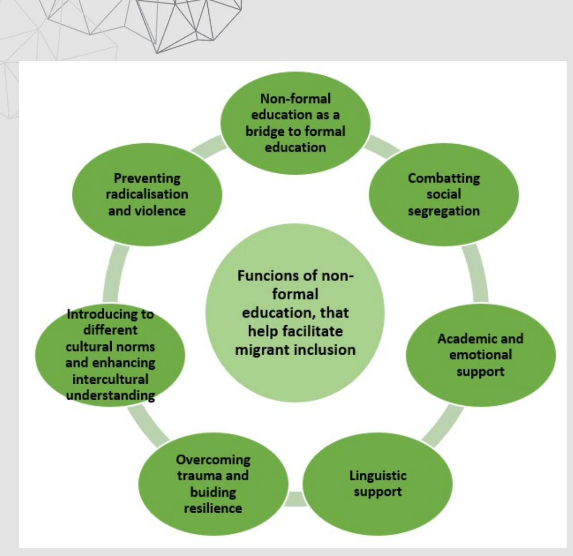
Supporting migrant children inclusion through NFE (Watch, 2018)